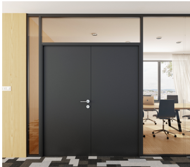
Wooden double-leaf door with overlight