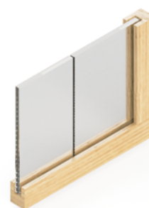
SINGLE GLAZED PARTITION