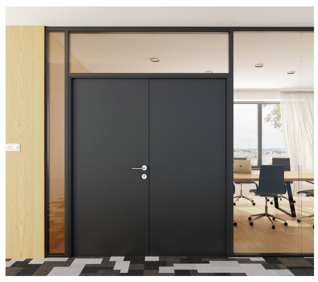
Wooden double-leaf door with overlight